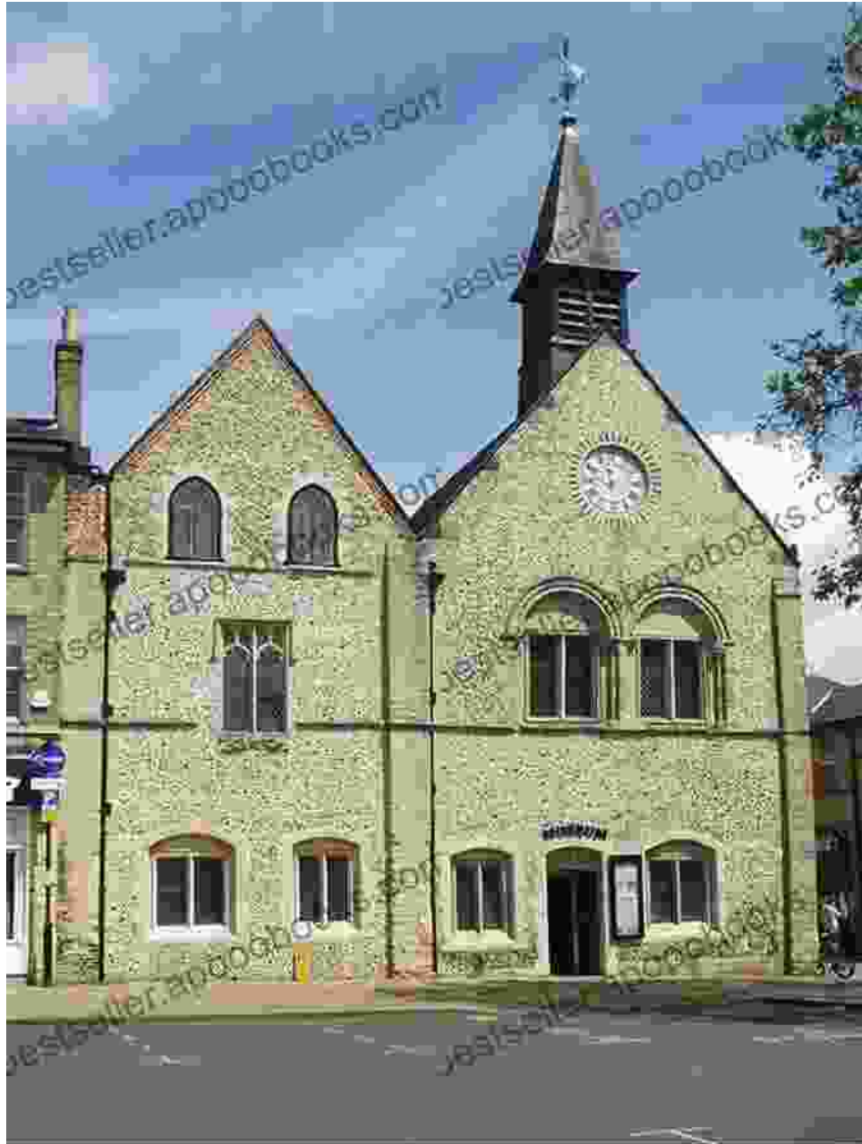
Moyes Hall Museum, Bury St Edmunds, a fascinating blend of architectural styles and a treasure trove of local history.