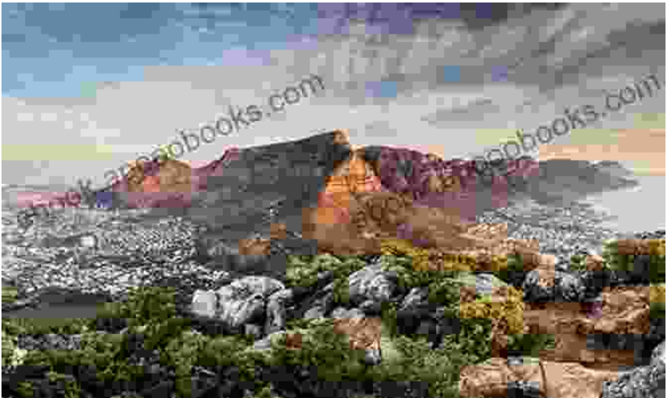
Table Mountain's Majestic Embrace