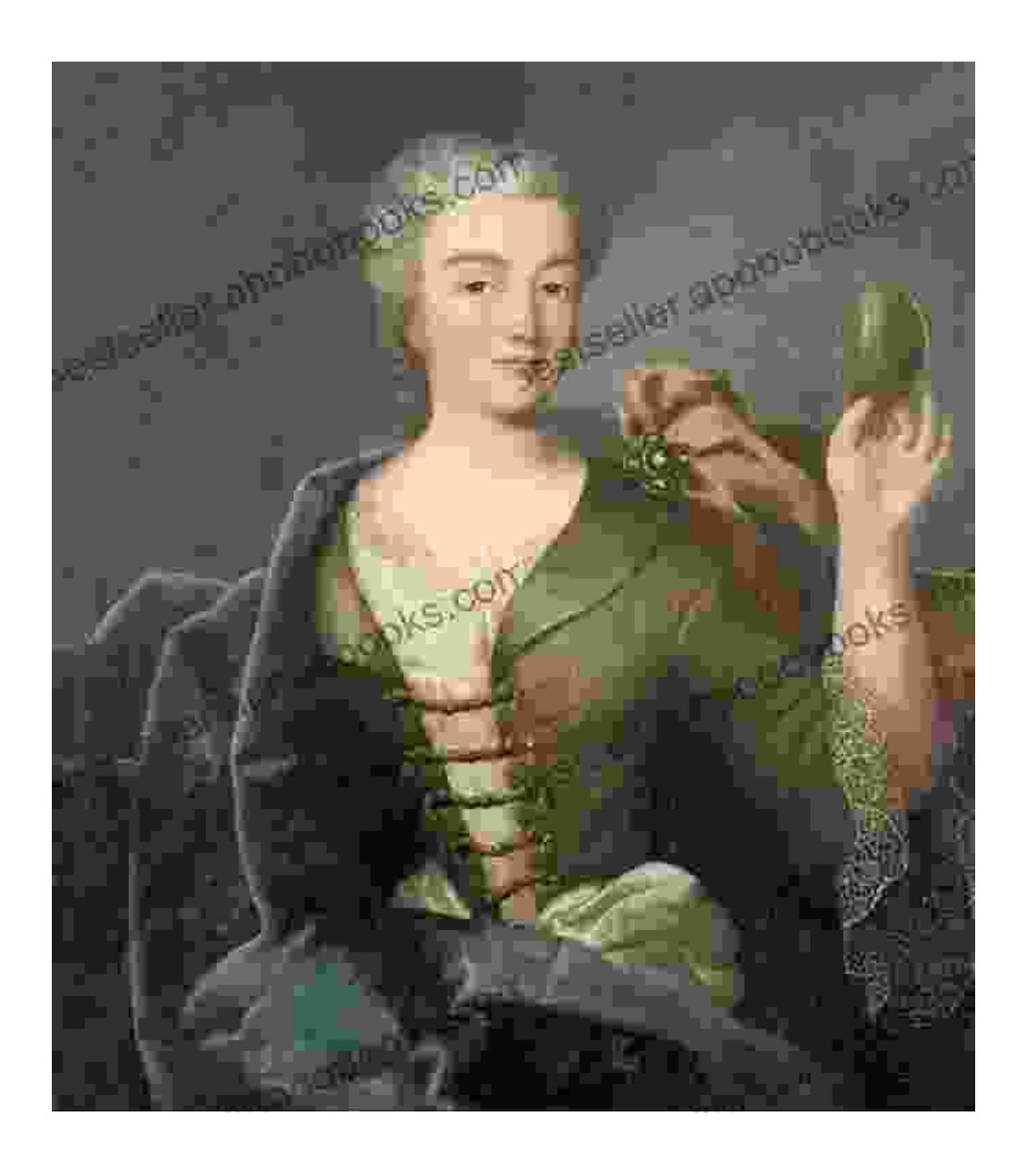
Mrs. Grant and Madame Jule by Jennifer Chiaverini

★ ★ ★ ★4.5 out of 5Language: EnglishFile size: 3115 KBText-to-Speech: Enabled