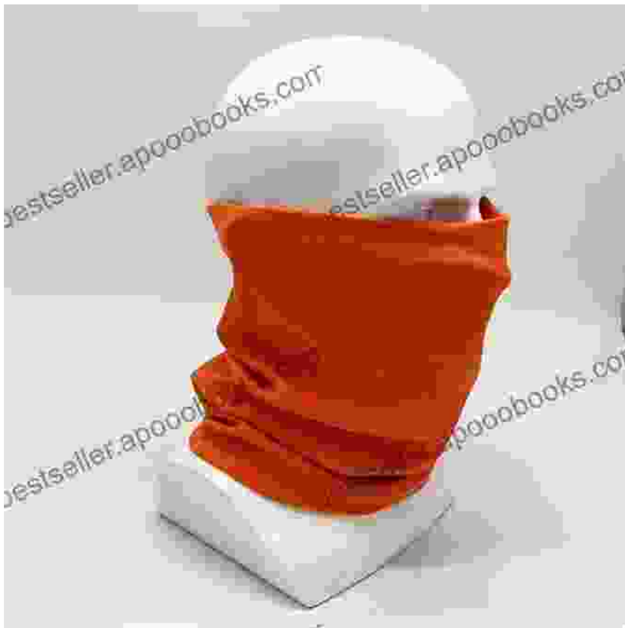
Adjustable and multi-functional tube neck warmer